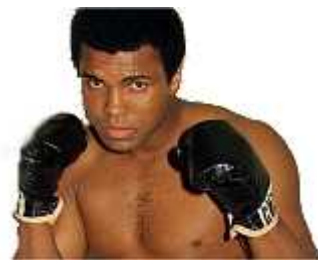
I am America. ~ Muhammad Ali

1. I am America. I am the part you won't recognize.